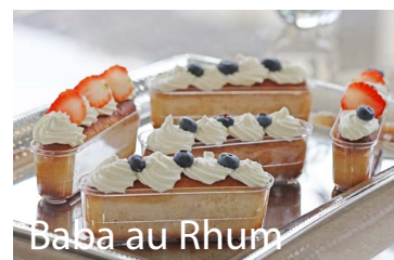
Baba au Rhum