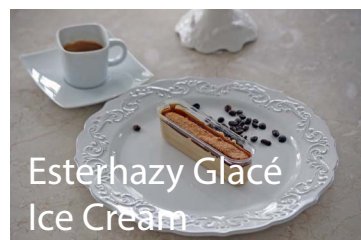
Esterhazy Glacé Ice Cream